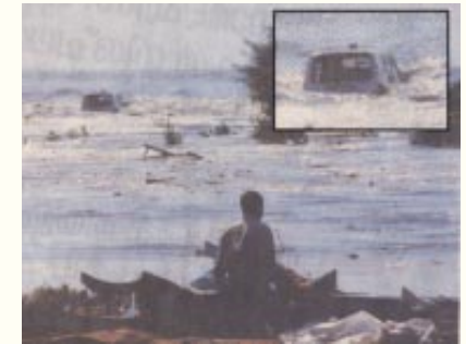
An Ambulance Van is being washed off into the Sea.